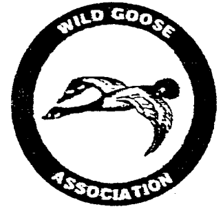
Exhibit 5 (page 2)