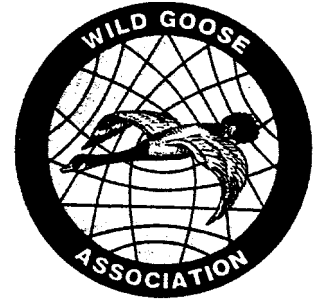
Exhibit 1 page 1